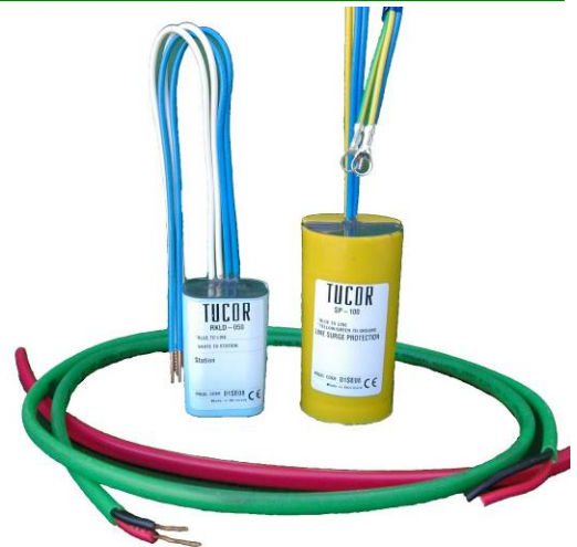
The RKLD-050 Line Decoder SP-100 Surge Protector Tucor Wire